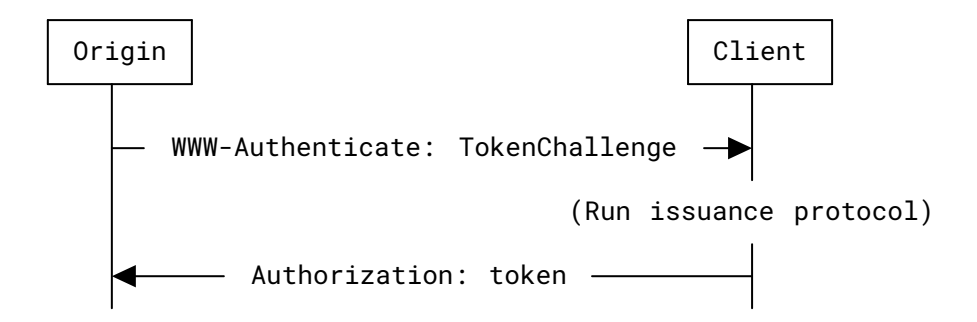
Figure 1: Challenge and Redemption Protocol Flow

In addition to working with different token issuance protocols, this scheme optionally supports the use of tokens that are associated with Origin-chosen contexts and specific Origin names. Relying parties that request and redeem tokens can choose a specific kind of token, as appropriate for its use case. These options (1) allow for different deployment models to prevent double-spending and (2) allow for both interactive (online challenges) and non-interactive (prefetched) tokens.