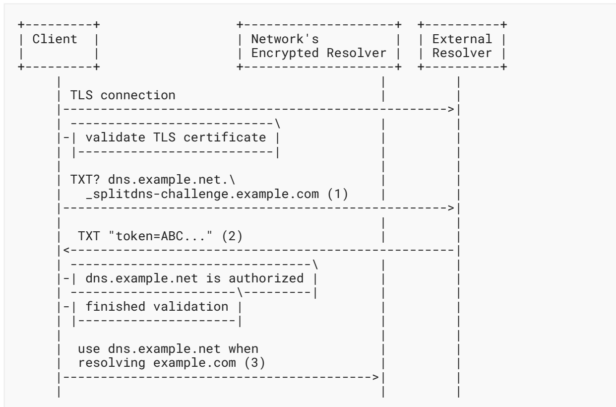
Figure 3: Verifying Claims Using an External Resolver